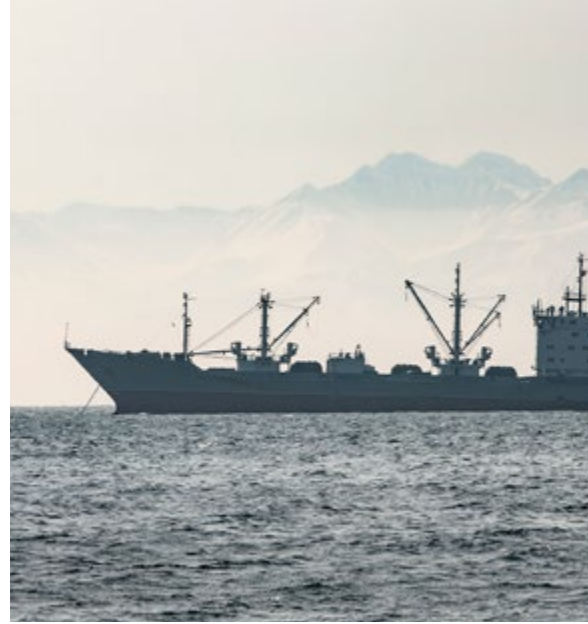
"Sweet spot" for beneficial ownership secrecy in the fisheries sector

When these two areas converge, they create a 'sweet spot' for beneficial ownership. The first stage of the fisheries value chain – the preparation for fishing, particularly the vessel registration process – exemplifies this sweet spot. According to the UNODC, the preparation stage is often where corruption risks and corruption scandals arise. For instance, bribes can be paid to register vessels using forged documents, or to turn a blind eye to unregistered vessels.<sup>11</sup>